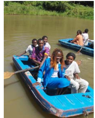
Girls on a boat ride