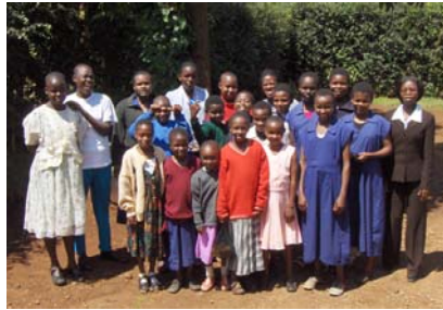
Girls in the after care program,

The Brenda Boone Tumaini Centre realized that after girls have been assisted in the centre, it is important to continue to help them transition back to living in their community as well as following up on the progress in their lives.