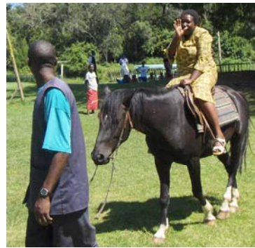
This brave girl opted to try horseback riding.

We were so happy that we were able to share a Christmas treat with our girls, and hope to make it an annual event.