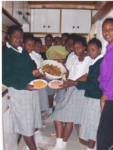
The girls learn how to make samosas in home

Mid year, the girls also began to be trained in Computer Studies through Sipet College, a local computer college who works in collaboration with Tumaini Centre to provide the girls with basic computer program training.