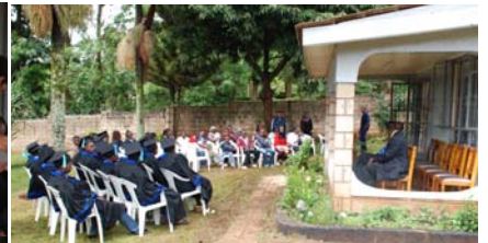
Graduation celebration at Tumaini Centre.