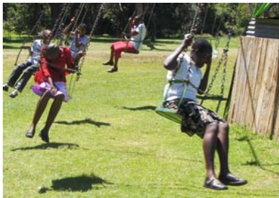
Girls take a ride on the swings

We went to Bantu lodge, and all the girls and staff got to participate in activities at the site. There was a choice between horse back riding, a boat ride, or an electrical merry go round! It was a difficult decision for all of us to pick which of the three we wanted to try!