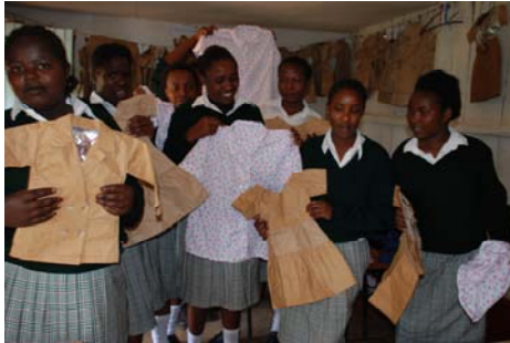
Tailoring students show off their practice designs.

The girls studying in the Vocational Training School had an eventful year. They were our very first group of girls, and so have learned with us as we worked through our very first year at the centre.